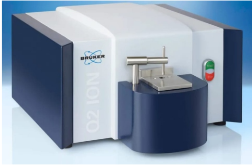
Spectrometer - Q2 ION Make - Bruker, Germany