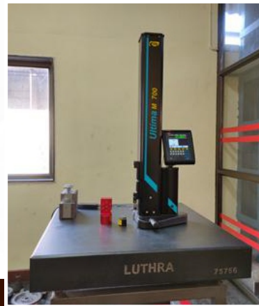
Trimos Make : Electronica