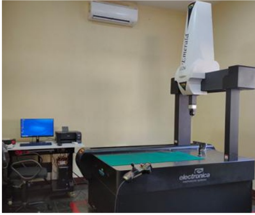
CMM Make : Electronica