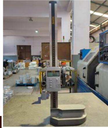
Digital Height Gauge Make : Baker